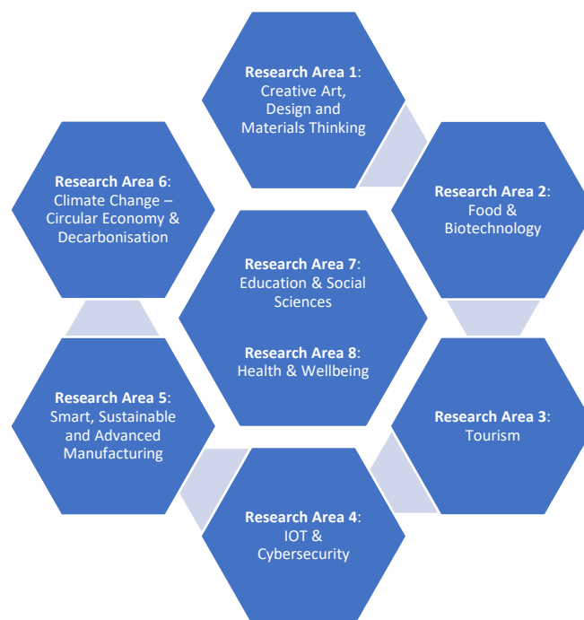
Figure 3 RUN-EU 8 future-looking joint RUN-EU RDI teams indicative research areas