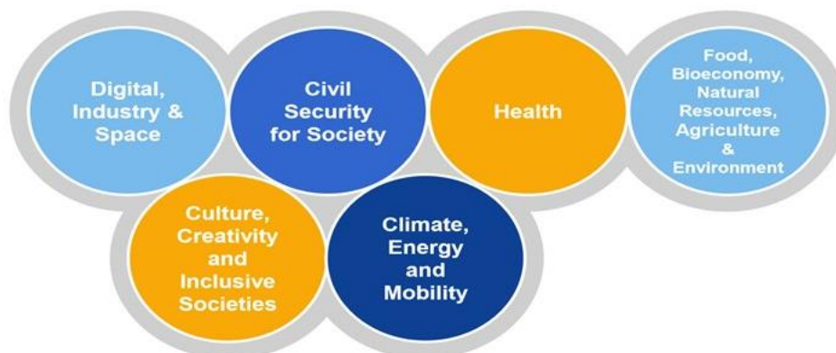
Figure 3 Horizon Europe research cluster areas

An audit template was created and distributed to partners for completion. The audit address three main areas within RUN-EU partner institutions. Our research audit within D5.1 has the expressed intention of creating joint future looking international RDI teams addressing real challenges identified by WP2 and also the six Horizon Europe identified research clusters; Cluster 1: HEALTH ; Cluster 2: CREATIVITY and INCLUSIVE SOCIETY ; Cluster 3: CIVIL SECURITY FOR SOCIETY ; Cluster 4: DIGITAL INDUSTRY and SPACE ; Cluster 5: CLIMATE, ENERGY and MOBILITY and Cluster 6: FOOD, BIOECONOMY, NATURAL RESOURCES, AGRICULTURE and ENVIRONMENT . These six clusters are ultimately designed to deliver of the five overarching missions of the Horizon Europe program namely (1) Adaptation to climate change including societal transformation ; (2) Cancer ; (3) Climate-neutral and smart cities ; (4) Healthy oceans, seas, coastal and inland waters and (5) Soil health and food .