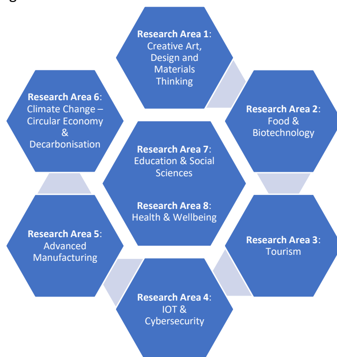
Figure 4 RUN-EU 8 future-looking joint RUN-EU RDI teams indicative research areas

D5.1 is gathering information related to technological systems and research infrastructures, both people and equipment, and facilities infrastructures that are available across the RUN-EU alliance, good practice approaches to our activities with a view to developing and identifying complementary collective expertise and knowledge and existing Intellectual Property/Knowledge know-how and tools. During our WP5 meetings in 2020 and 2021, eight research areas of complimentary research expertise were identified which would form the basis for eight indicative future looking research cluster areas of expertise across the consortium. The areas are: Research Area 1: Creative Art, Design and Materials Thinking; Research Area 2: Food & Biotechnology; Research Area 3: Tourism; Research Area 4: IOT & Cybersecurity; Research Area 5: Advanced Manufacturing; Research Area 6: Climate Change – Circular Economy & Decarbonisation; Research Area 7: Education & Social Sciences and Research Area 8: Health & Wellbeing.