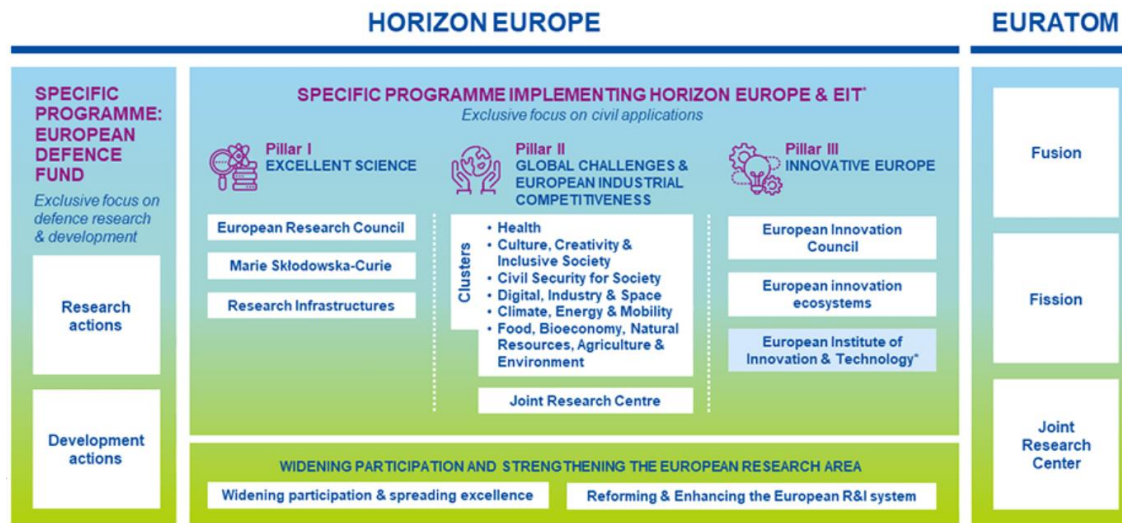
Figure 2 Horizon Europe preliminary structure

An audit template was created and distributed to partners for completion. The audit address three main areas within RUN-EU partner institutions. Our research audit within D5.1 has the expressed intention of creating joint future looking international RDI teams addressing real challenges identified by WP2 and also the six Horizon Europe identified research clusters; Cluster 1: HEALTH ; Cluster 2: CREATIVITY and INCLUSIVE SOCIETY ; Cluster 3: CIVIL SECURITY FOR SOCIETY ; Cluster 4: DIGITAL INDUSTRY and SPACE ; Cluster 5: CLIMATE, ENERGY and MOBILITY and Cluster 6: FOOD, BIOECONOMY, NATURAL RESOURCES, AGRICULTURE and ENVIRONMENT . These six clusters are ultimately designed to deliver of the five overarching missions of the Horizon Europe program namely (1) Adaptation to climate change including societal transformation ; (2) Cancer ; (3) Climate-neutral and smart cities ; (4) Healthy oceans, seas, coastal and inland waters and (5) Soil health and food .